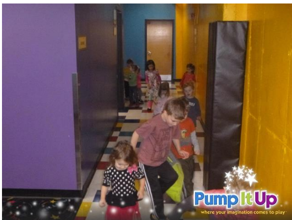
Good idea to get kids in transition. Kneeling down would have made this a better shot.