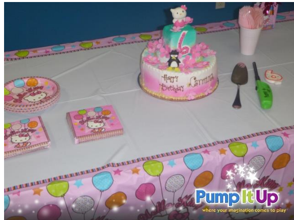
Great idea getting a picture of the cake and decorations.