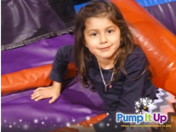
Great close-up shot!