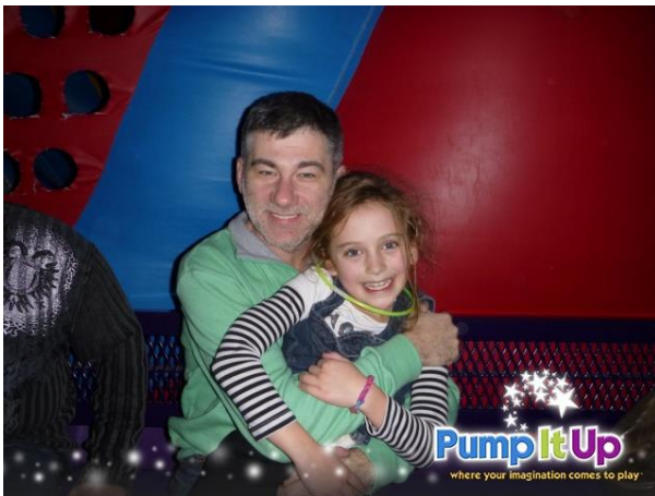
Good idea getting some parent's in the shot.