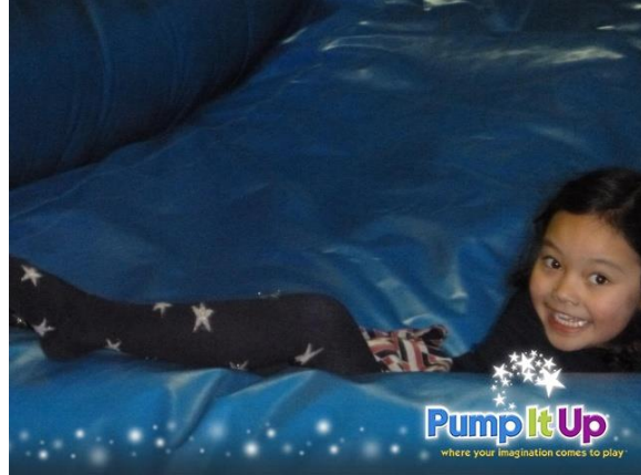
Another good shot. Well-cropped.